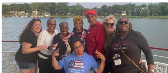
Members of the Department of Maryland had fun in the sun on a riverboat tour during National Convention in Louisville, Kentucky.