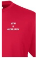
On left chest