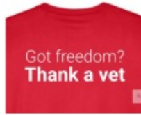
On the back

All shirts are men's sizes. Cost is $20 regardless of size. Sizes are Small – 4XL. Shirts will be ordered and brought to District meetings.