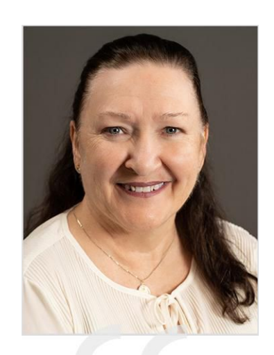
I've had so many truly unforgettable and once-in-a-lifetime experiences thanks to your warm hospitality.