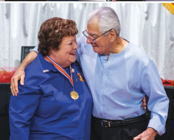
PREVIOUS PAGE: Circle of Excellence inductees (above) and (below) members celebrate at the VFW's Patriotic Celebration. See captions for pages 10, 11 and 12 on page 14.